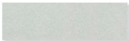
Clear Anodize Mica

Airolite offers six standard Mica colors available in AAMA 2605 compliant coatings (70% Kynar® PVDF/ 100% Fluoropolymer FEVE). Mica colors are formulated to reproduce the low-gloss metallic luster of anodized aluminum in a wider range of dynamic colors. These colors offer many performance advantages over conventional anodic finishes including longer warranty duration, superior resistance to salt spray, greater color uniformity and better chemical resistance. Additionally, Mica coatings are easier to repair and touch-up than conventional anodic finishes. Organic micas are comprised of natural minerals and crushed pearlescent that are highly resistant to harmful environmental effects.